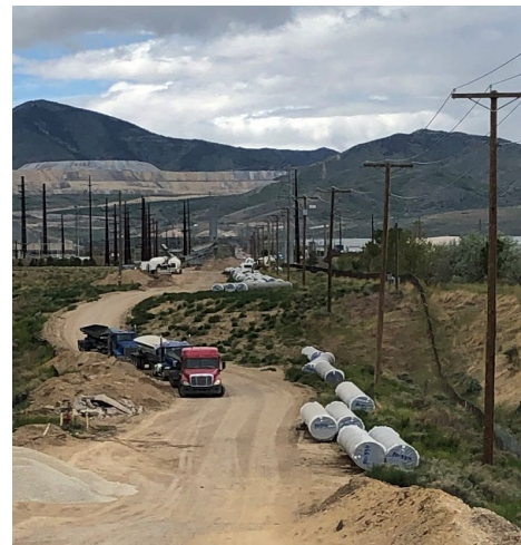
Staging material along Daybreak property.