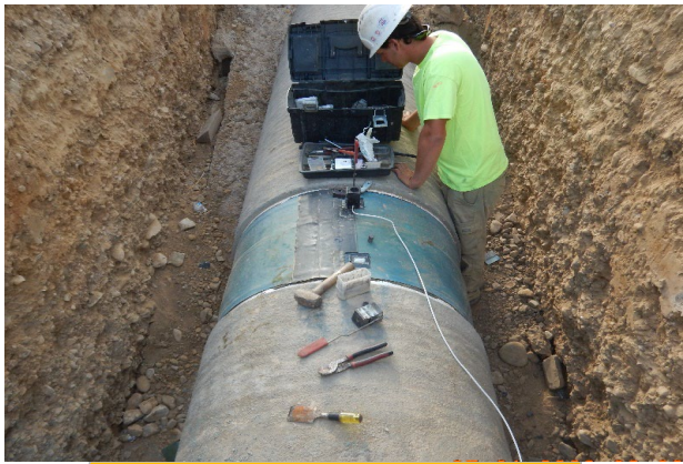
Cad weld for cathodic test station.