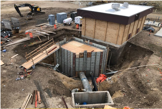
New interconnect vault for the reservoir and suction piping.