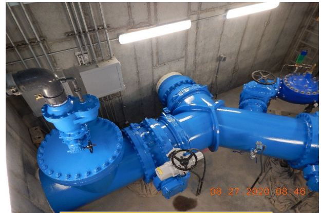
New 30-inch piping and valves.