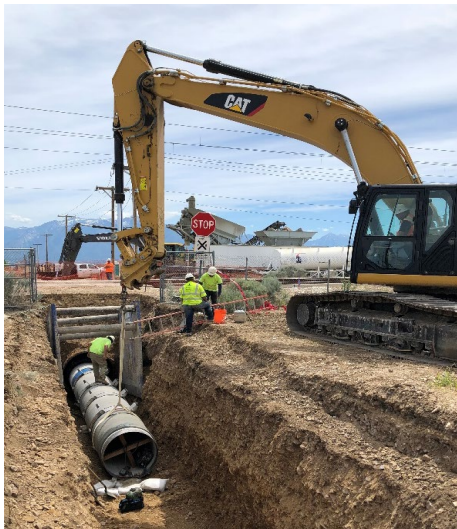
Inserting pipeline into steel casing beneath Trax line.