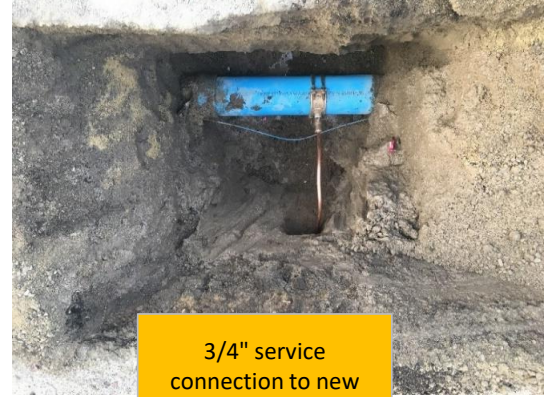
3/4" service connection to new pipeline