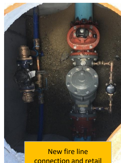
New fire line connection and retail meter