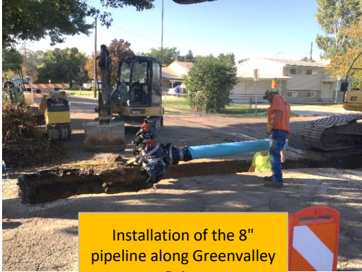
Installation of the 8" pipeline along Greenvalley Drive