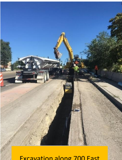
Excavation along 700 East