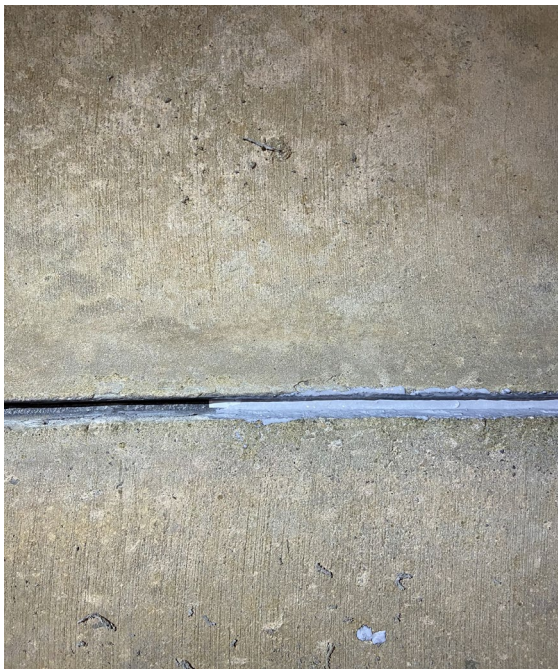
Installation of the backing tape and Sikagard-62 primer.