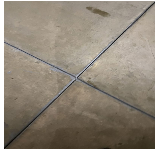
Sikagard-62 primer placed in preparation for joint sealant.