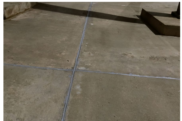
Installation of Sikaflex joint sealant on floor.