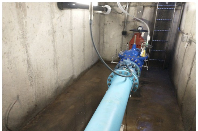
New pipeline, meter, and valves