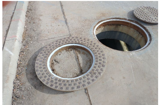
Sealing manhole to limit water intrusion