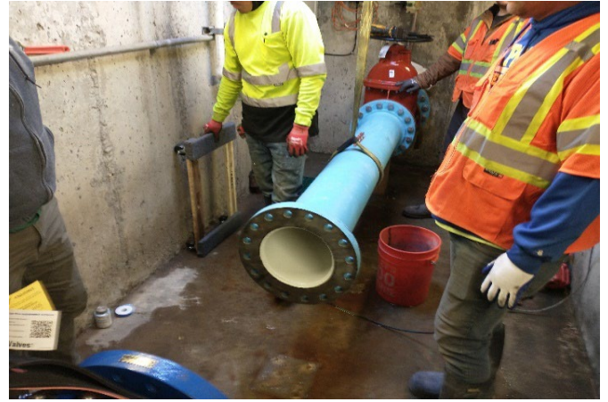
Installing new pipe in vault