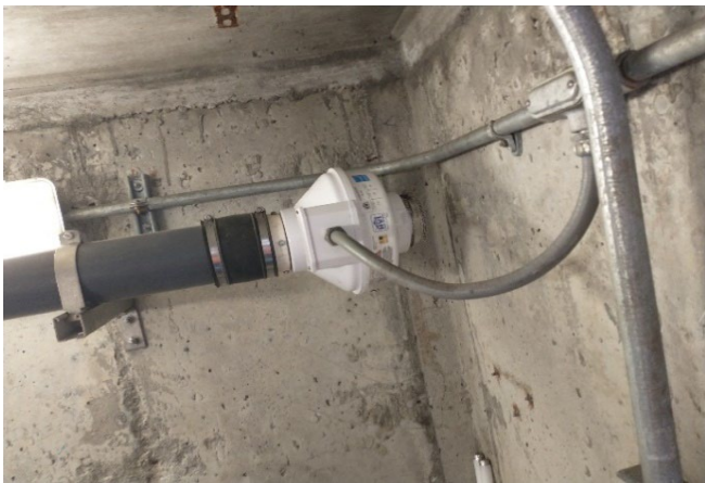
New installed ventilation fan