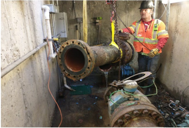
Removing the old corroded pipe