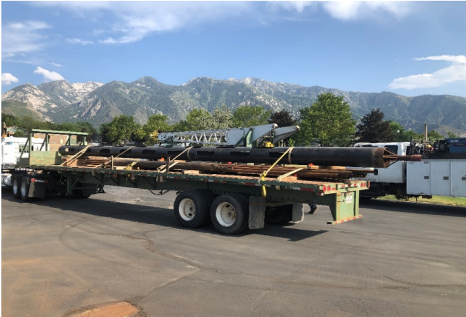
Mobilizing to site to perform the alignment test.