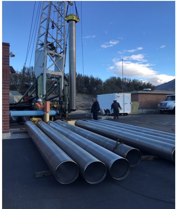
Installation of the first section of the 16" stainless steel screens.