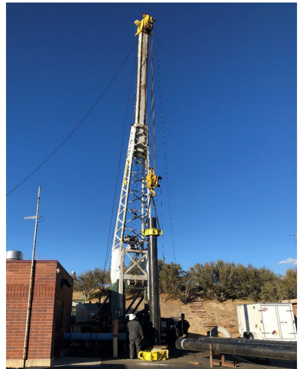
Installation of the steel casing.