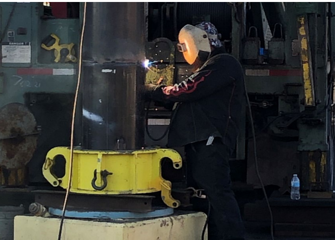
Welding of a steel casing joint.