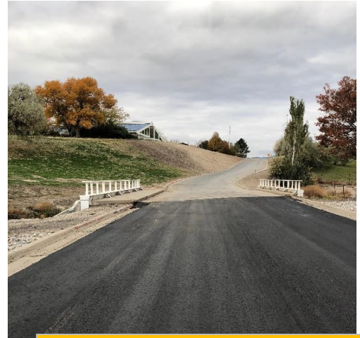
Looking west towards North Canal Bridge