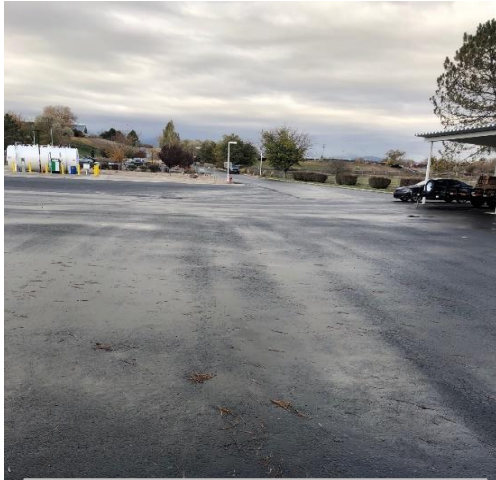
New Asphalt at North Gate