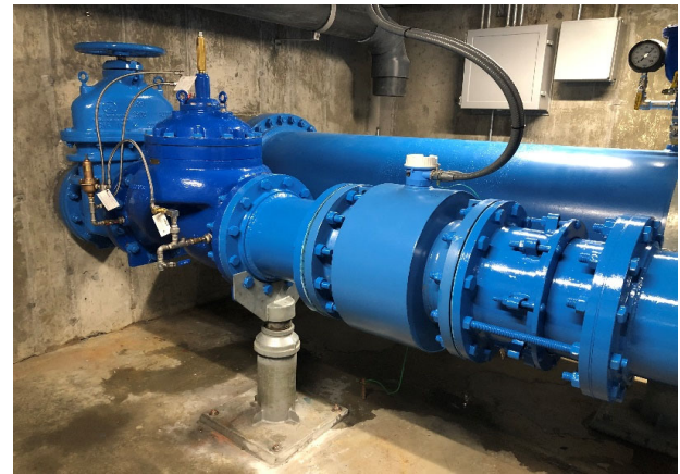
Installation of PRV at the 987 E 7800 S meter station