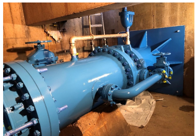
Application of paint coatings