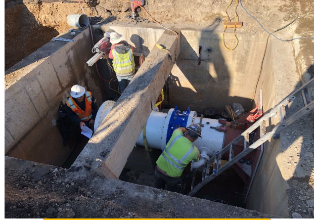
Installing piping at 1300 W vault