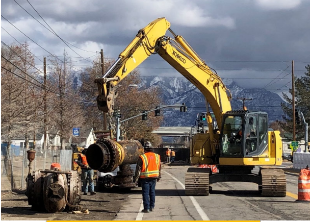
Removal of existing 30" piping and valves