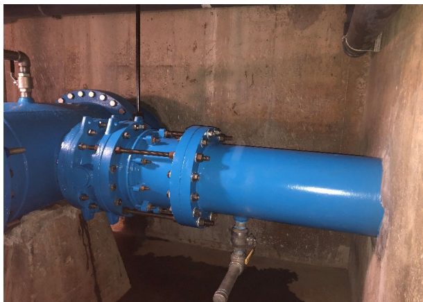
16 inch turn out for Midvale's future meter station