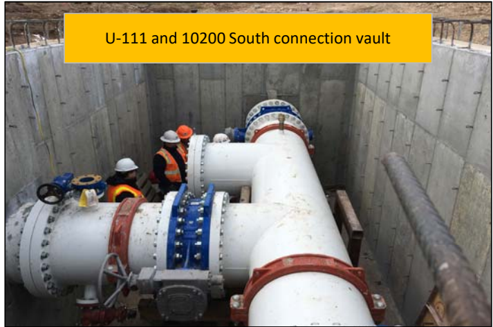
U-111 and 10200 South connection vault