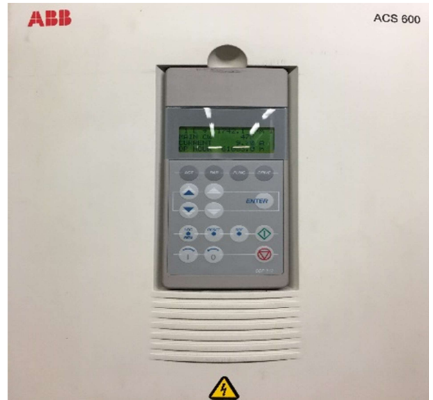
Hardware connecting equipment to network.