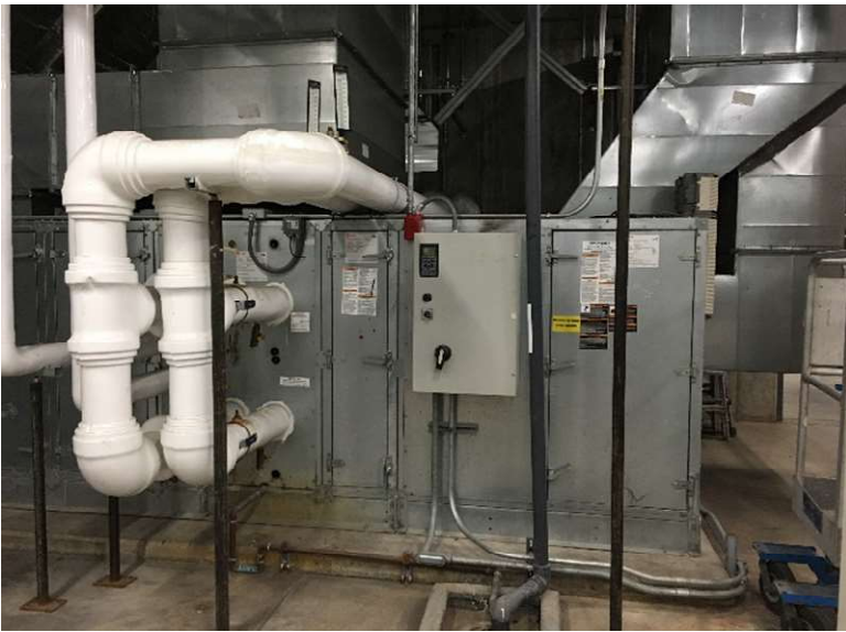
Equipment controlled by the new integration program (Typ.)