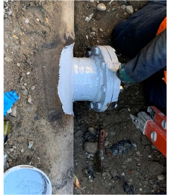
Coating existing turnout on the 900 East pipeline.