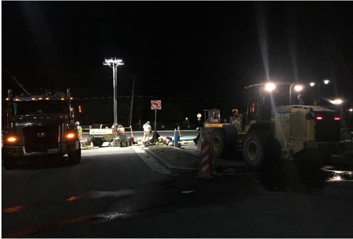
Night time water shutdown to minimize customer impact.