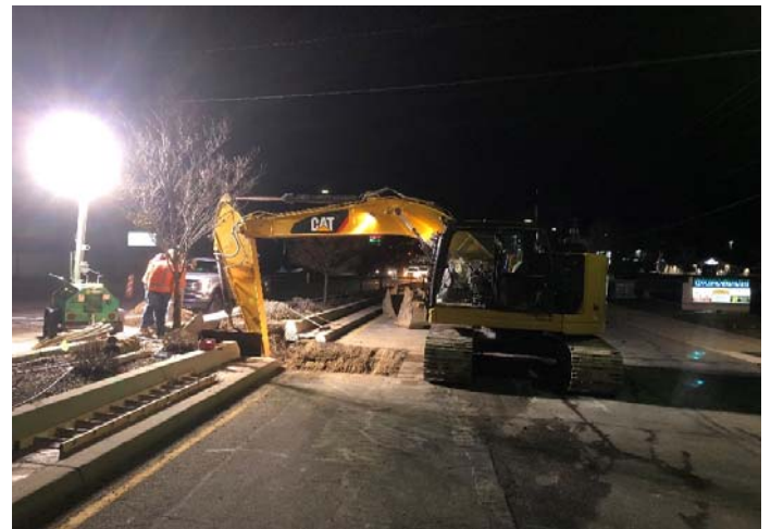
Performing valve abandonment on Union Park Avenue.