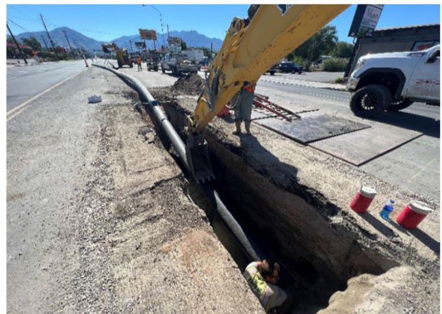
Slip lining the 12-inch HDPE within an existing 16-inch steel casing