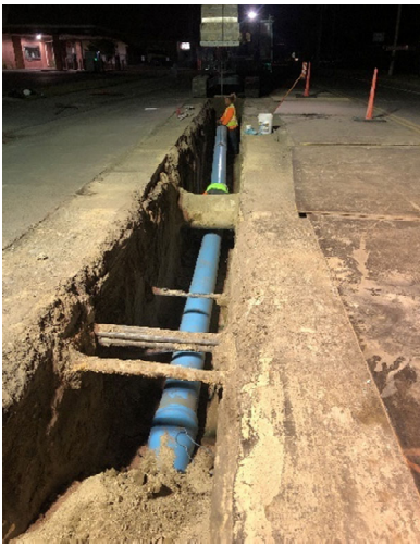
Installing 12-inch PVC pipeline