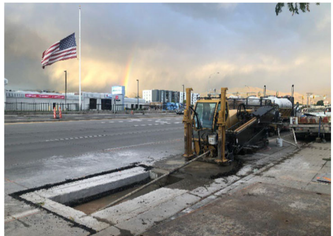
Directional drill rig