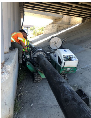
Fusing HDPE beneath 1-15 preparing for a 760-foot directional drill