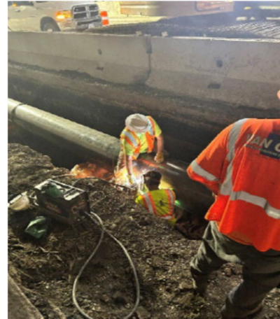
Welding steel casing within the Union Pacific ROW