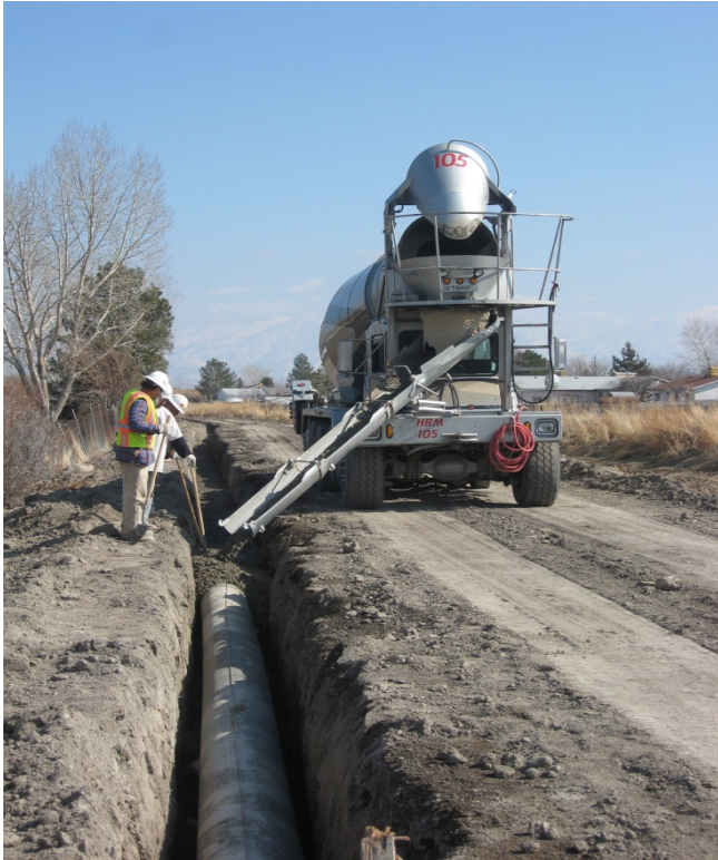
Installation of pipe and flow-fill along U&SL Canal