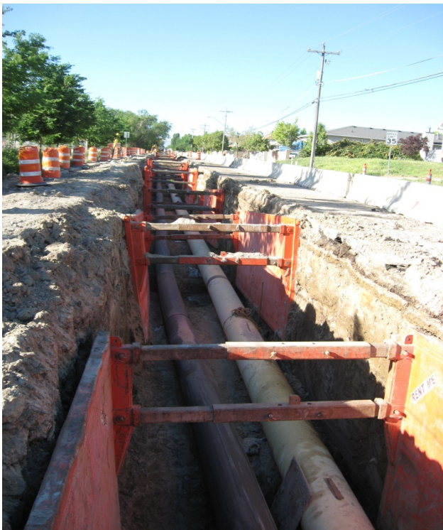
Installation of Byproduct and Finished Water Pipelines in same trench in 1300 West