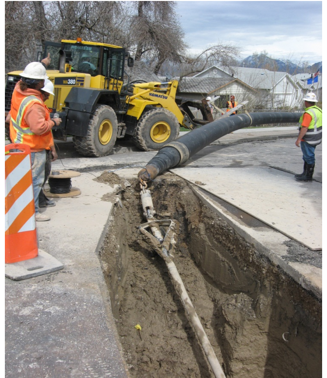
Directional drilling under Redwood Road