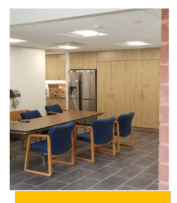
New multi-use room