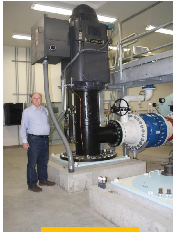
Installed pump and motor