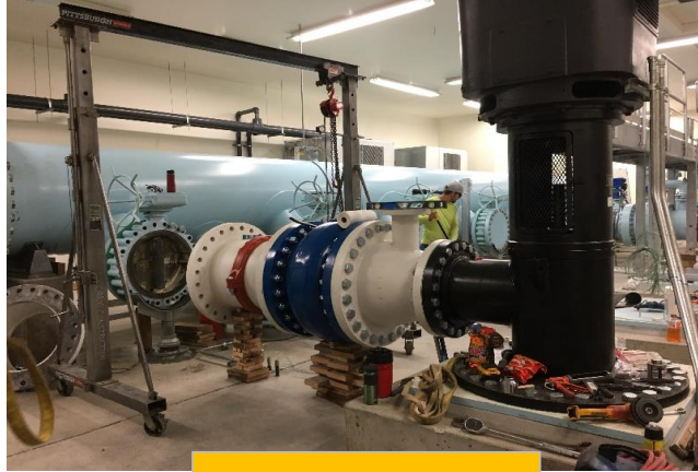
Construction in progress