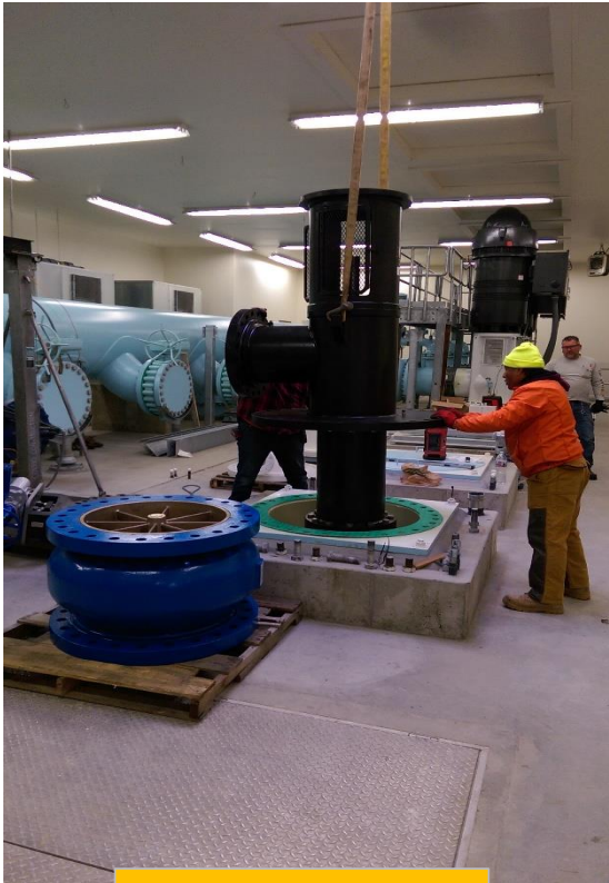
Installation of new pump