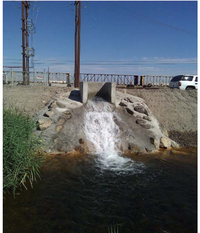
Completed toe ditch discharge point