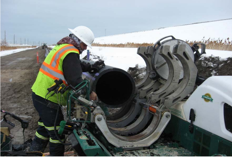
Fusing HDPE pipe at Kennecott