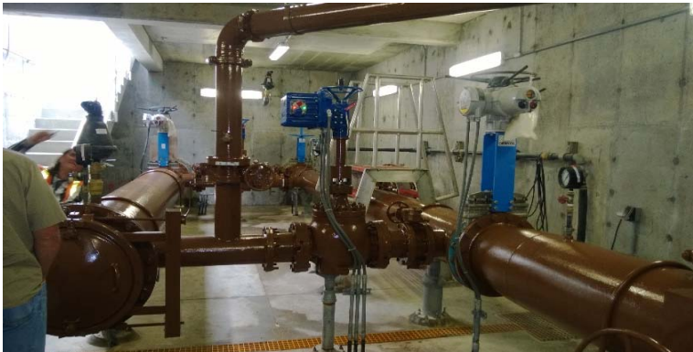
Completed pressure sustaining vault near the Great Salt Lake