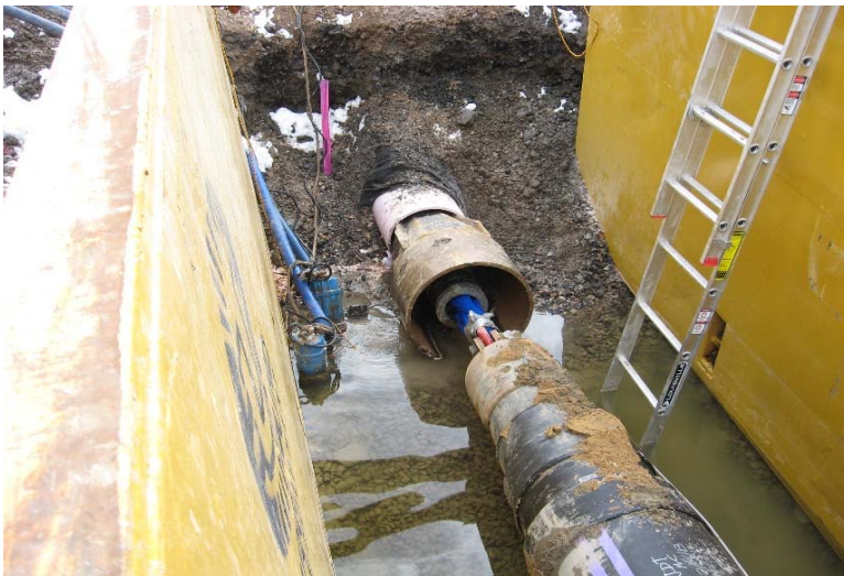
Pipe bursting to install new HDPE pipe