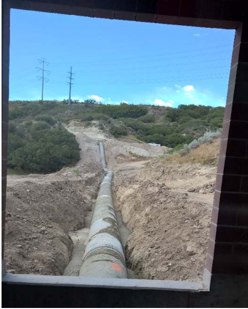
Central Pipeline mid-backfill, south of the Fluoride Building