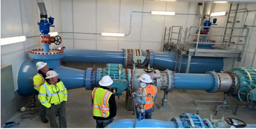
The interior of the CUWCD North Turnout Vault