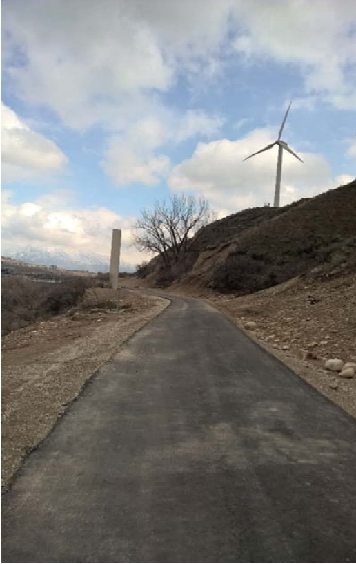
Completed trail section in Jordan Narrows area