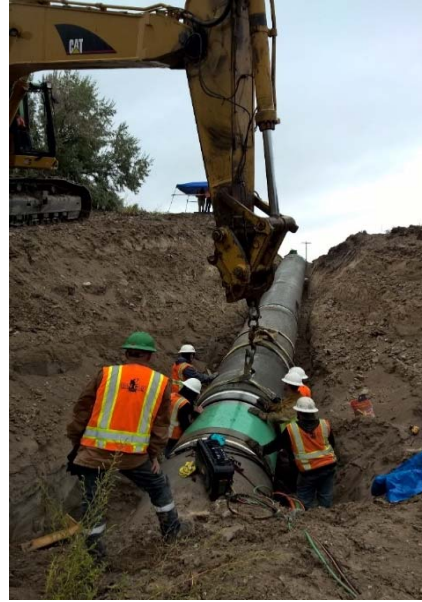
Last stick celebration on Aug 3, 2015