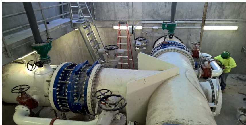
Central Pipeline connection to the 15000 S Pipeline, near completion