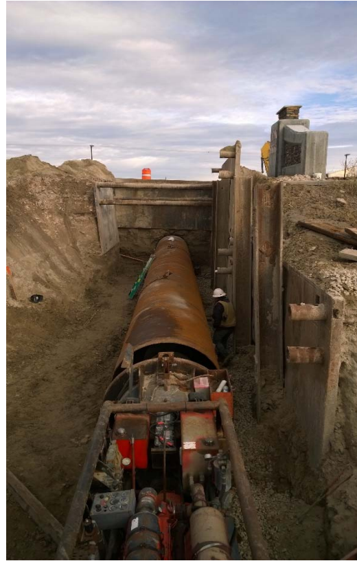
Pushing casing under 2100 North