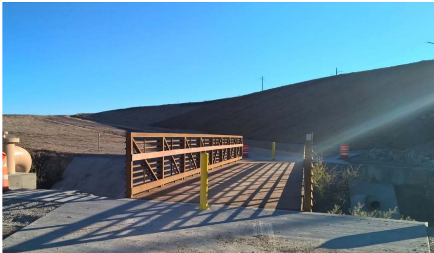
Completed Central Pipeline & Salt Lake County Trail Bridge at Utah & Salt Lake Canal Crossing