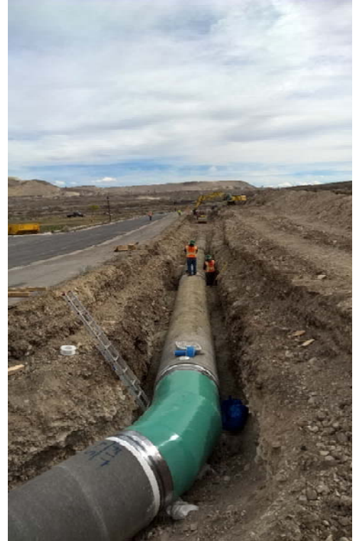
Central Pipeline installation along Iron Horse Blvd