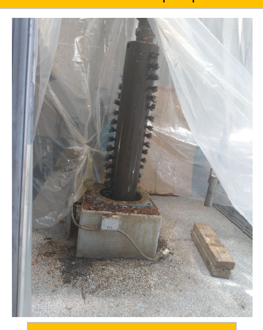
Brushing the well shaft