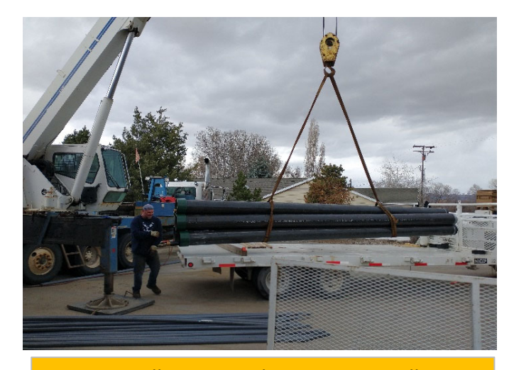
Installing new column pipe in well