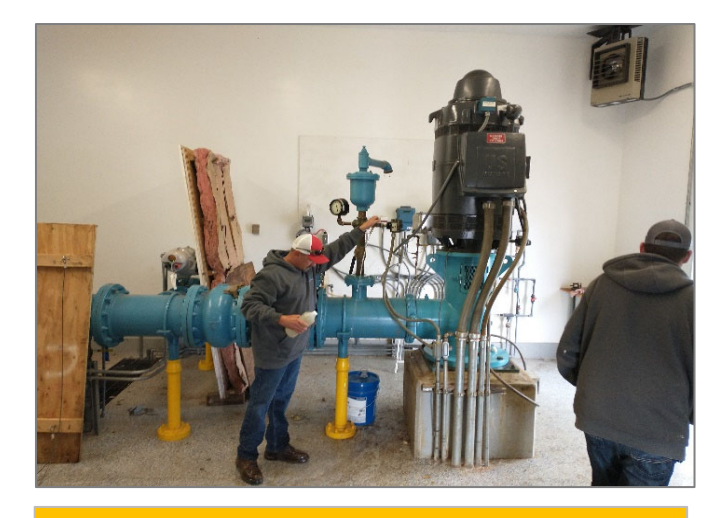
Reassembled pump operating