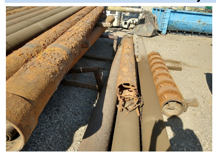
Condition of removed pump and column