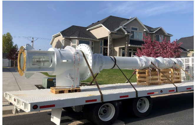
Pump delivered to the site