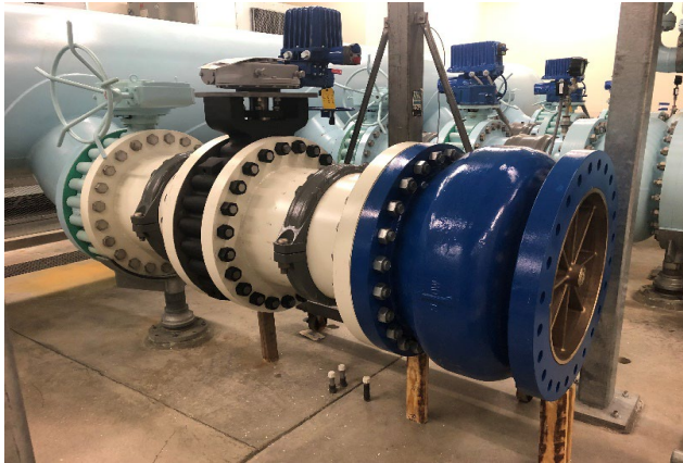
Installing 24" discharge piping