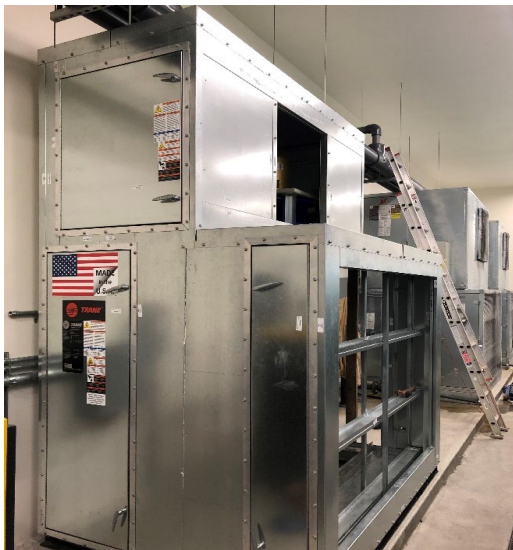
Assembling new air handling unit