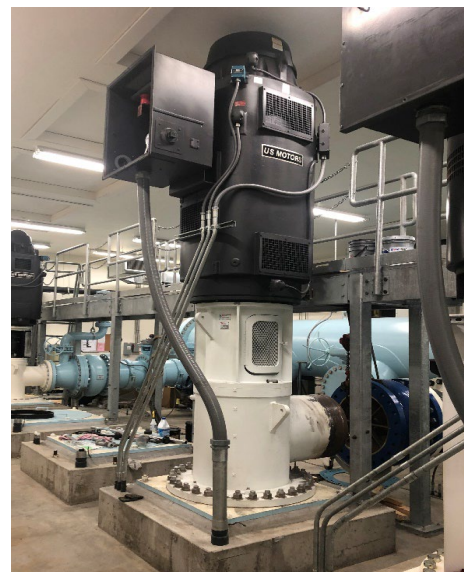
New 1250 HP pump & motor