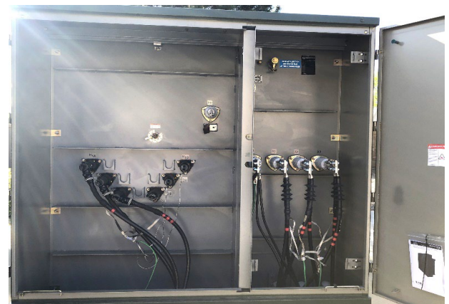
4000 kVA transformer