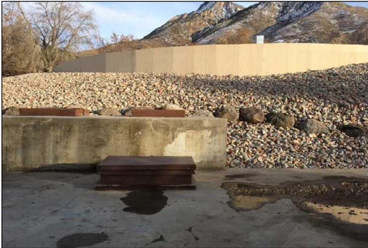
Lowered grades and rock erosion protection on the backside of the reservoir