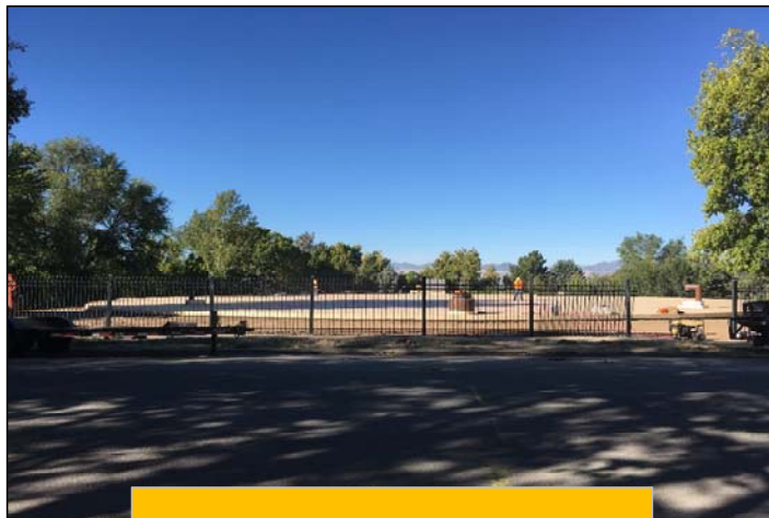
Street view of the reservoir