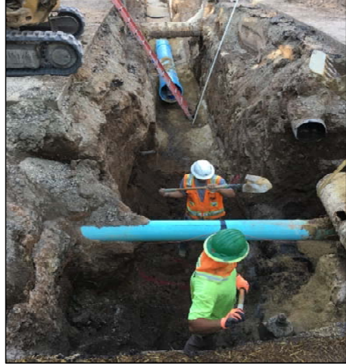
Connection complications arising from condition and location of utilities in the street