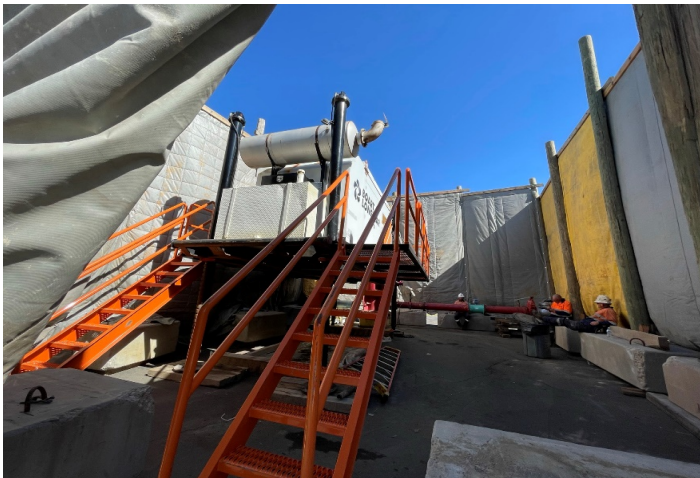
Sound attenuation panels.