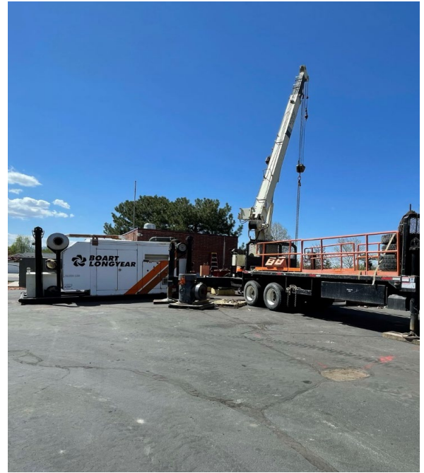
Installation of the test pumping equipment.