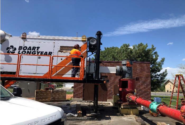
Generator and pump discharge head.