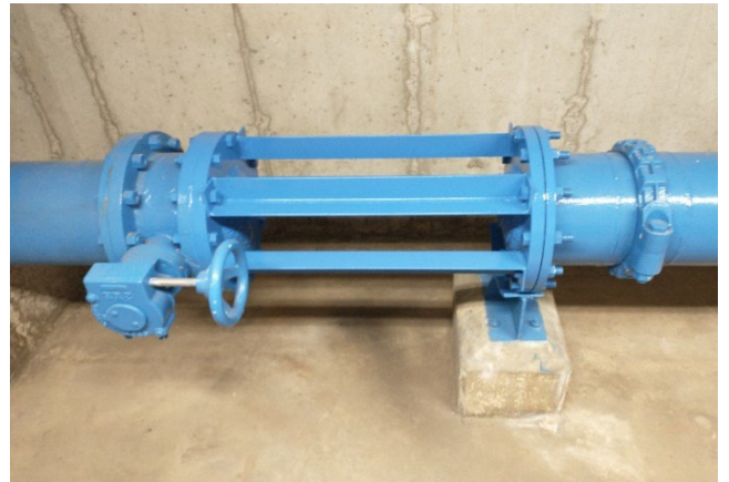
Blind flanges installed to isolate old water