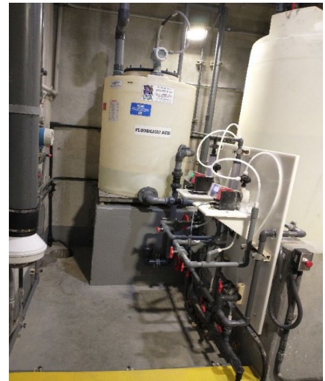
Completed new day tank