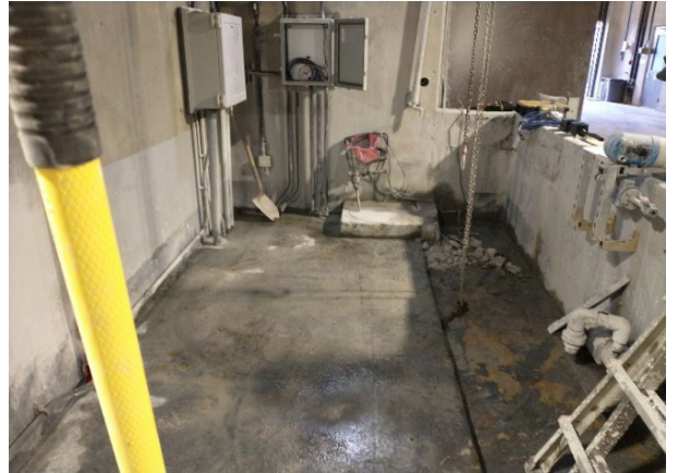
Concrete demolition in fluoride room