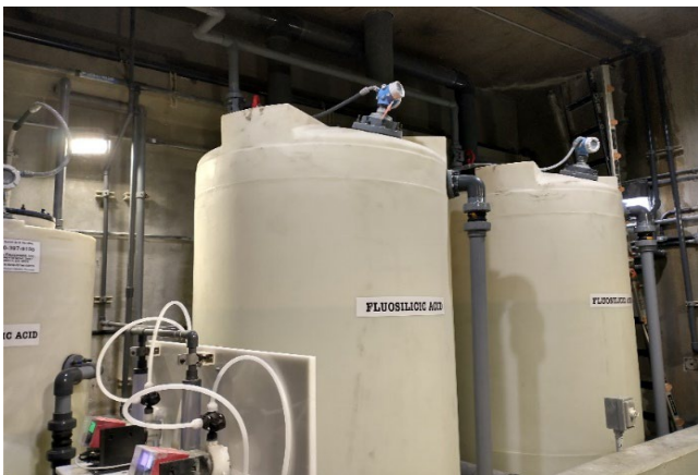
Completed new fluoride room tanks and piping.