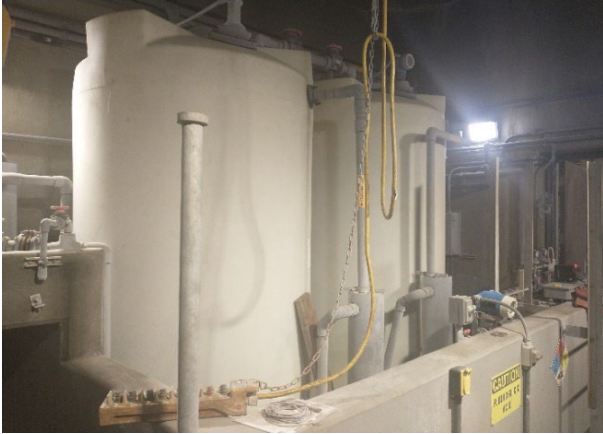
Old SERWTP fluoride room setup