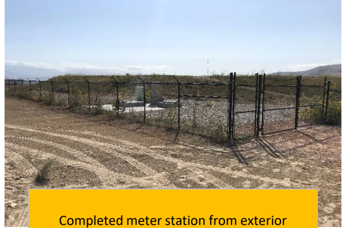
Completed meter station from exterior