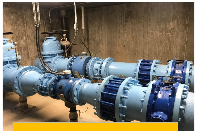
Completed meter station from interior