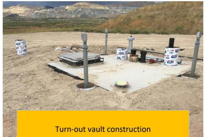
Turn-out vault construction