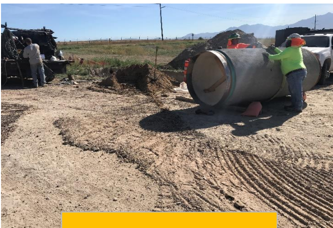
Pipeline material ready for installation