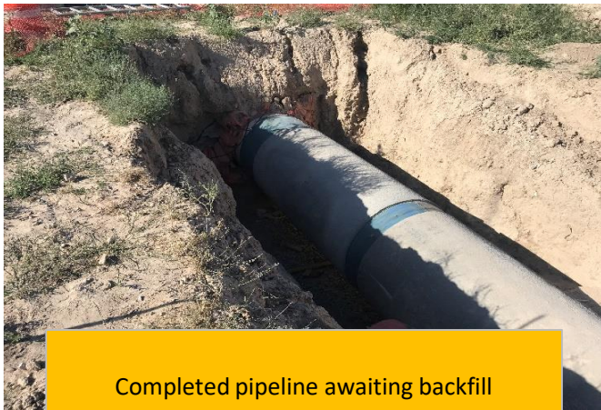
Completed pipeline awaiting backfill