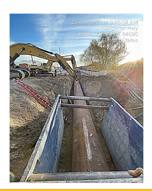
Installation of the 60" casing through the JA-2 easement