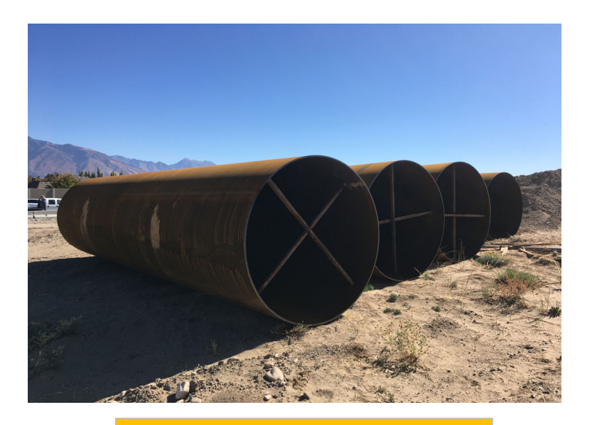
60" casing prior to installation