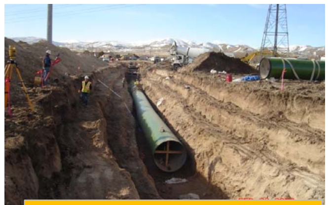
Open field trench north of 14400 South