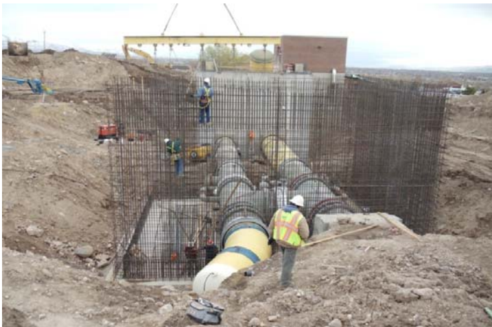
Tying wall reinforcement at JWTP vault