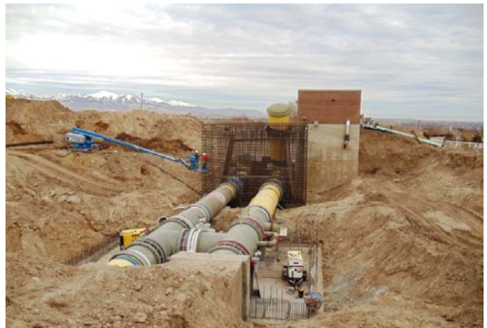
JA and SWA interconnection at JWTP