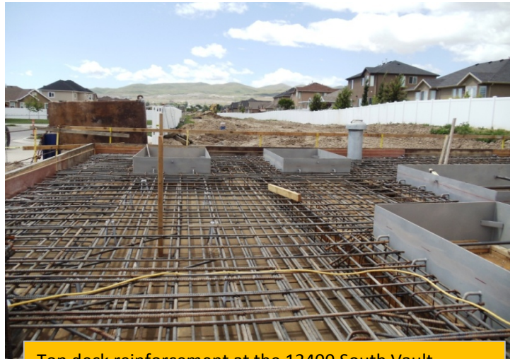
Top deck reinforcement at the 13400 South Vault