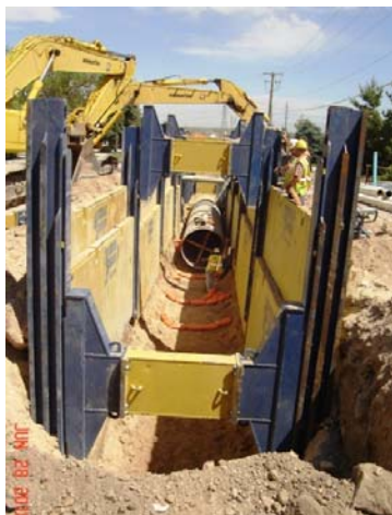
Pipe laying in trench box