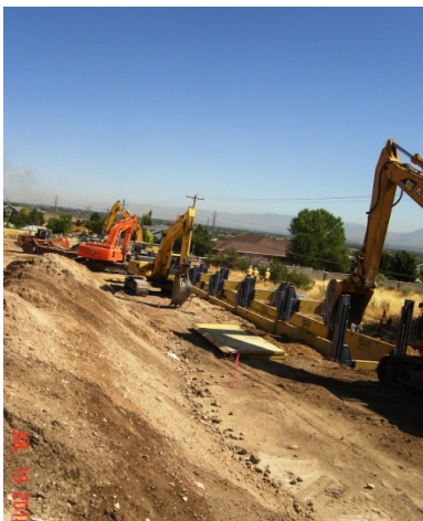
3200 W trench box