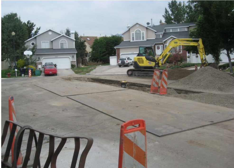
Construction on Woodpine Circle, Sandy, Utah