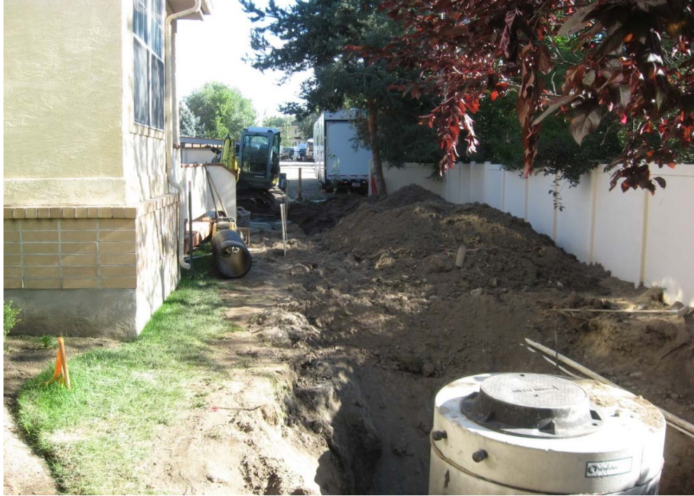
Construction at Briarwood Condominiums