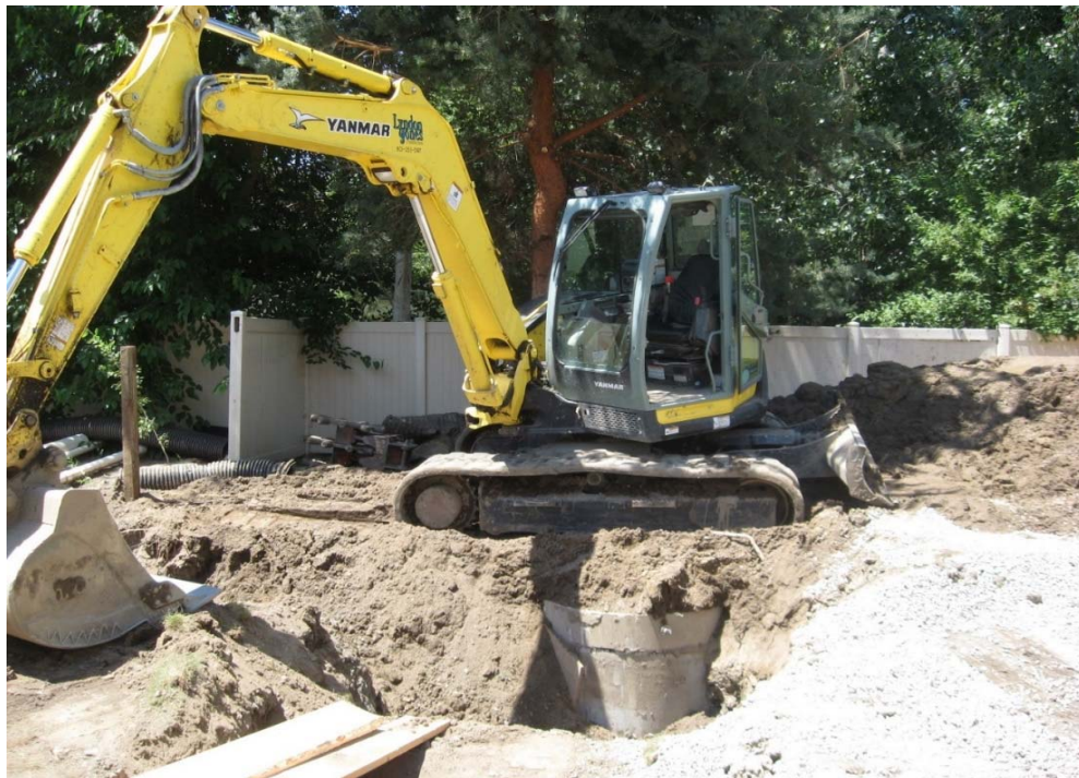
Construction connecting in to existing upstream storm drain system