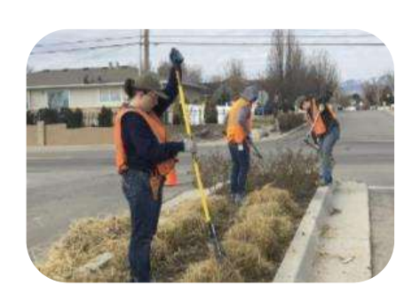
Seasonal Staff Wages

Grant funds can be used for general operations of the garden. Starting in 2024 most of the funds were used towards seasonal staff wages.