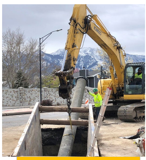
Installation of 16-inch piping at 7940 S 1300 E