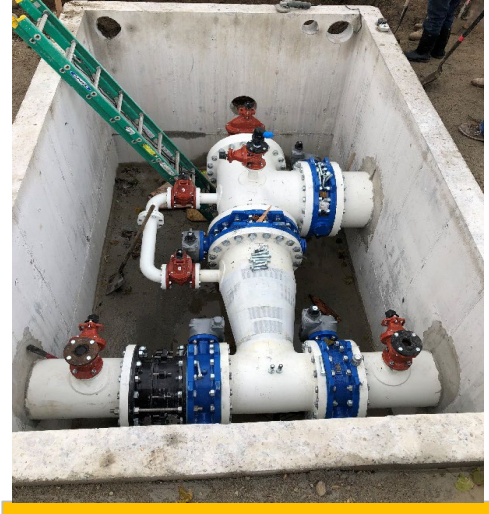
New piping and valves at 1300 E 8600 S