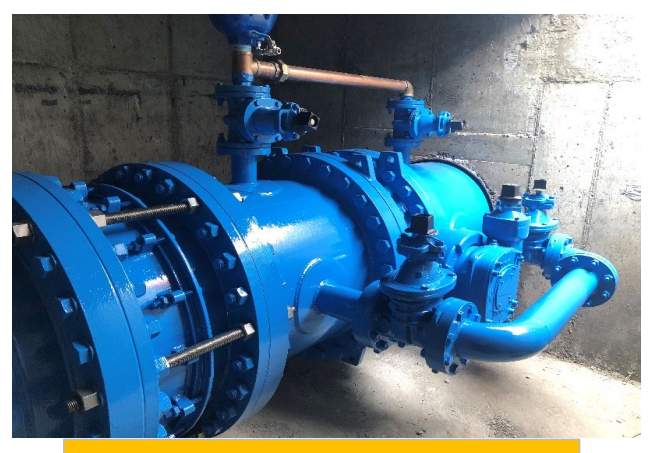
Coated vault piping at 2200 W 6200 S