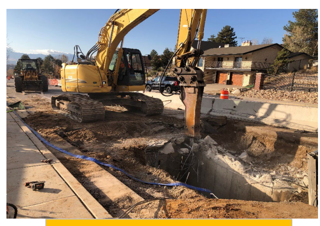
Vault abandonment at 2520 E 11700 S