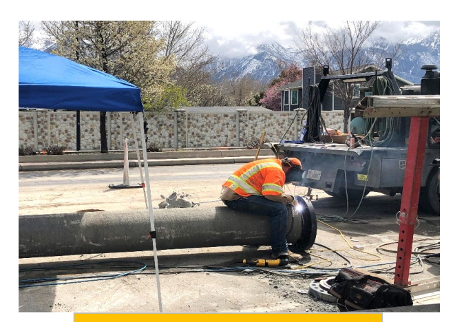
Field welding 16-inch flange