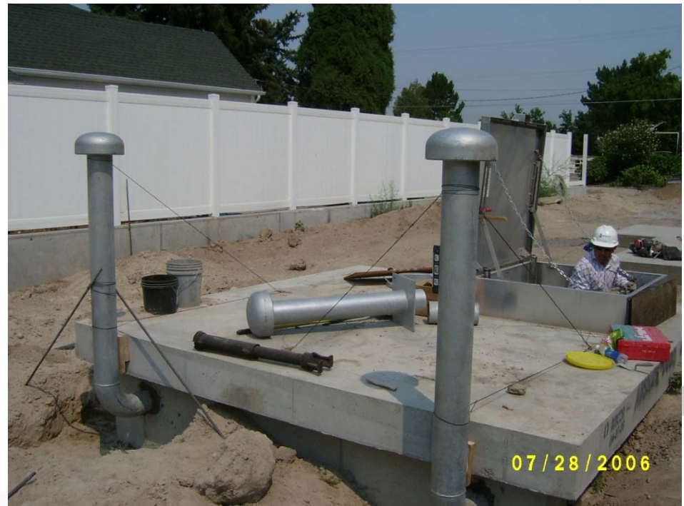
1028 E. College Street – Installation of surge tank vault.