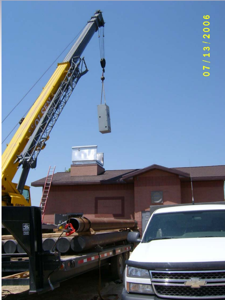
275 E. Carol Way – Delivery of pump motor control unit.