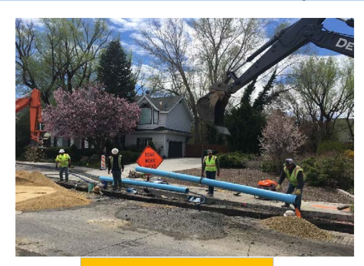
Installation of the 8" pipeline along Creekview Drive.