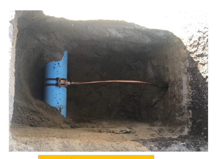
New 3/4" service connection.