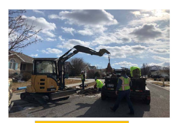
Replacing valves in the Foothills subdivision.