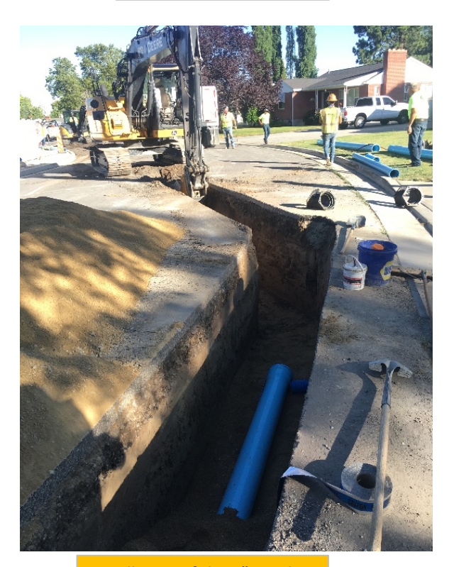
Installation of the 8" pipeline along Julep Drive.