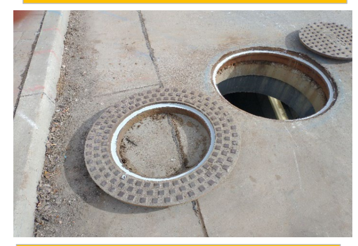
Sealing manhole to limit water intrusion