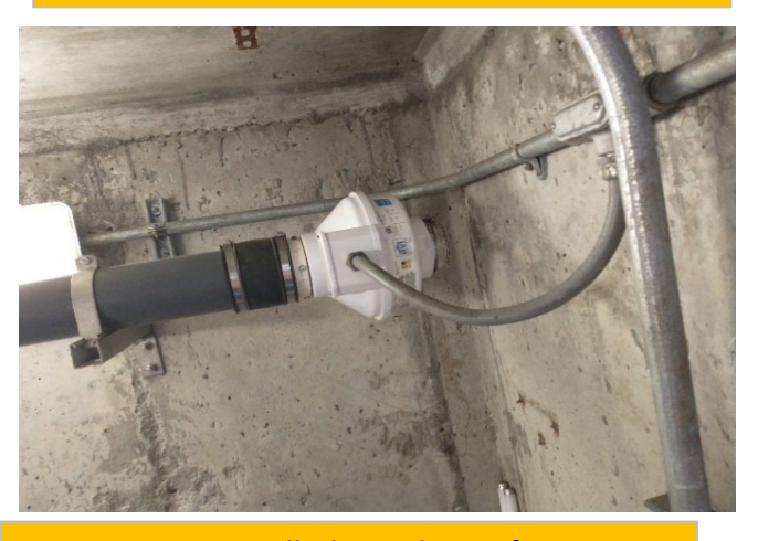
New installed ventilation fan