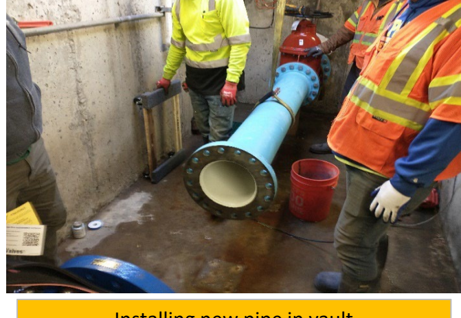
Installing new pipe in vault