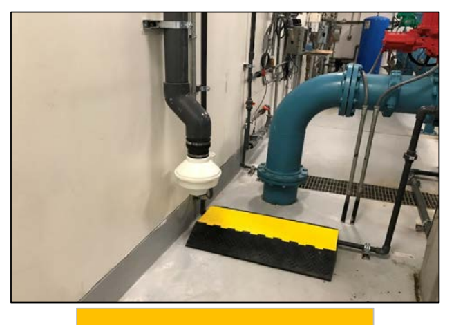
New safety ramp and fan at 1453 East 9400 South