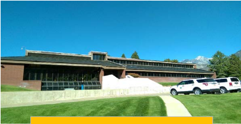
Filter Building south view