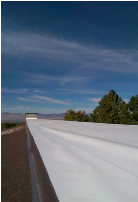
Filter Building Clerestory Thermoplastic Polyolefin