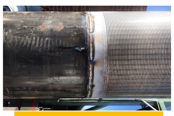
Welded joint, transitioning from stainless steel screens to steel casing.