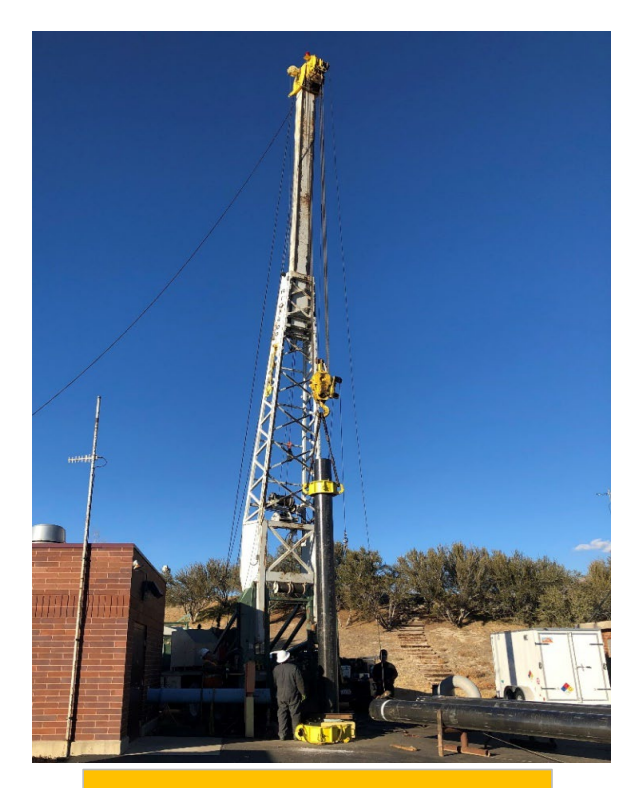
Installation of the steel casing.