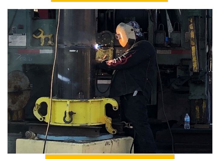
Welding of a steel casing joint.