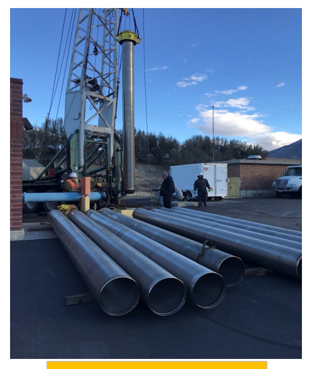
Installation of the first section of the 16" stainless steel screens.